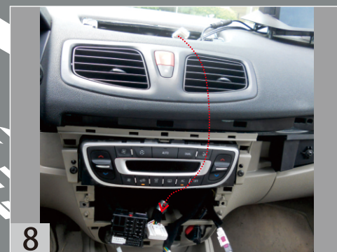
8 Pull the DVD connector out as showed on the picture (inside the dashboard) .