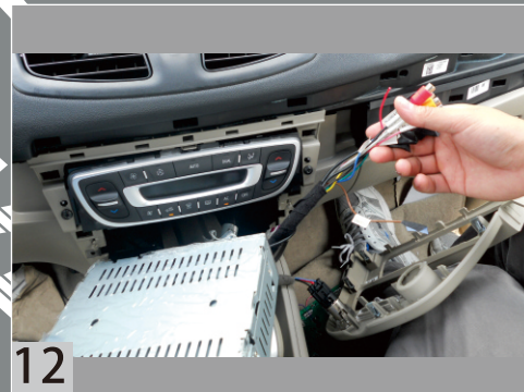
12 Tight up the back harness.