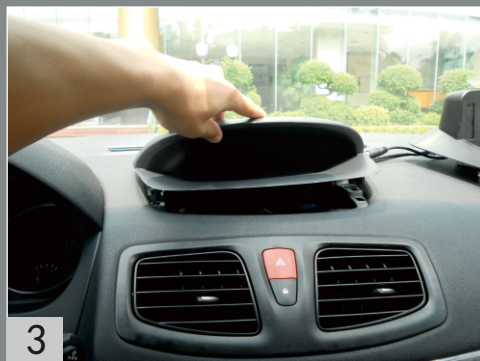
3 Unplug the back harness of the original small screen, and take out the units. Keep the Iron Buckle on the back separately.