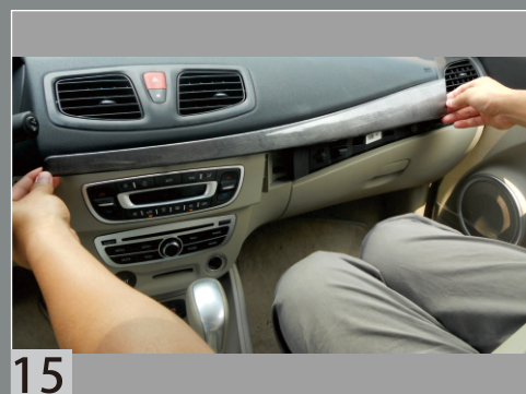
15 Install the original decorative trim.