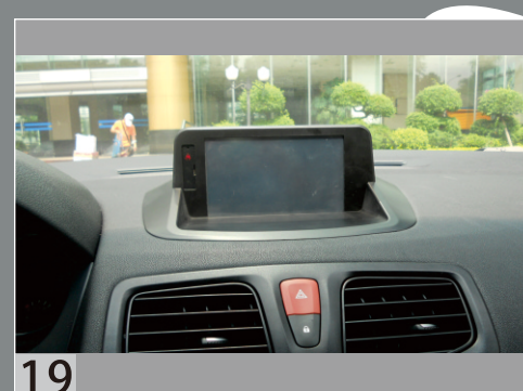
19 Install the monitor.