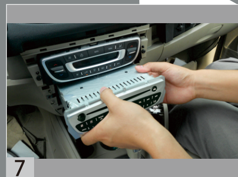
7 Take out the original CD and keep the side bracket separately.