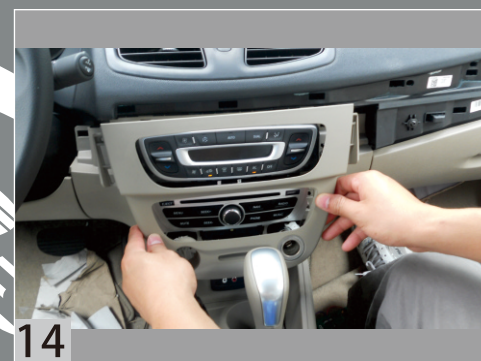
14 Plug the back harness of original radio and install it.