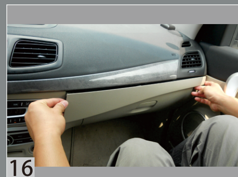
16 Install the panel on the top of Glove box.