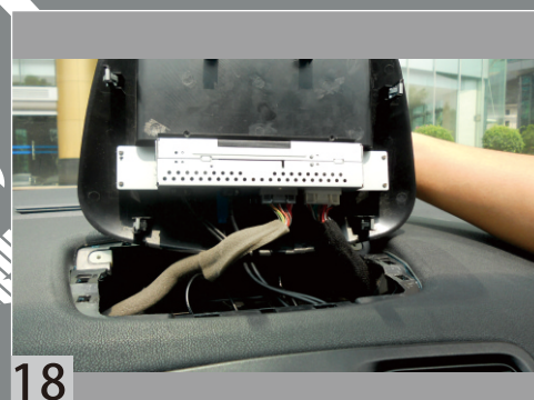
18 Plug the back harness of the monitor.