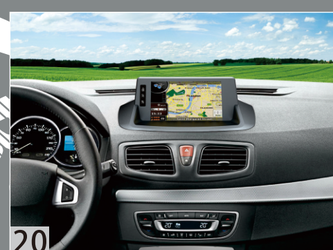
20 Installation finished.