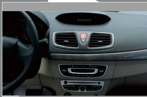
1 The original head unit before installation.