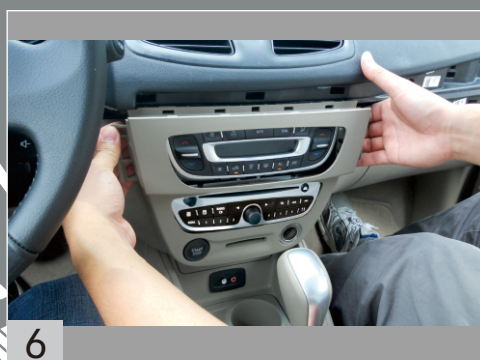
6 Open the cover of glove compartment, remove two screws on the top