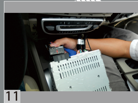
11 Plug the back harness of the DVD loader.