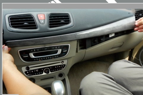
5 Remove the decorative trim shown on the picture.