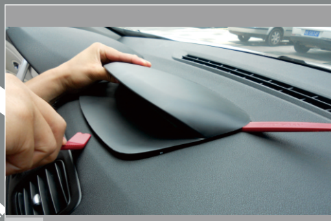
2 Take out the top frame of the original small screen.