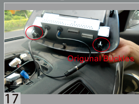
17 Fix the original iron buckle on the monitor, connect the IPOD cable with original cable.