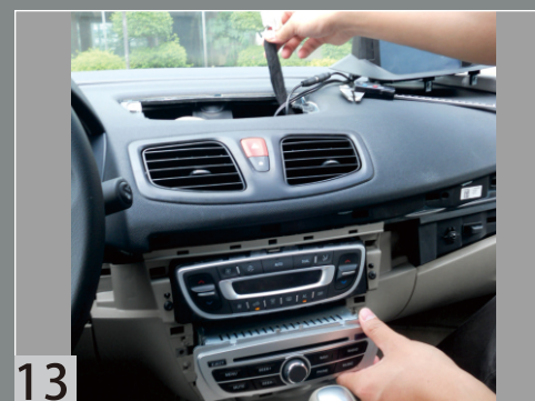
13 Install the DVD, meantime plug the connect to the suitable place.